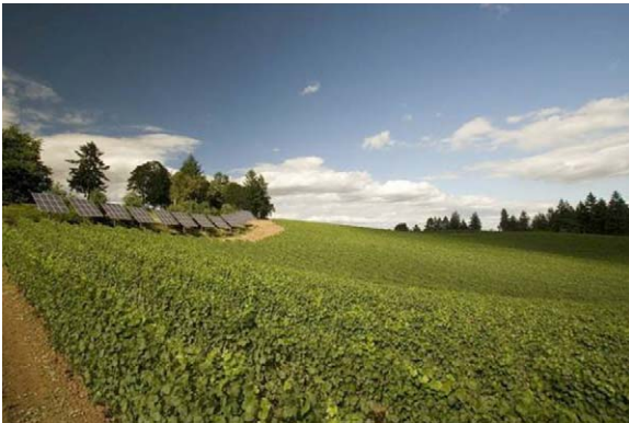
Fig. 12. Photovoltaic system at Sokol Blosser Winery (reproduced by kind permission from Sokol Blosser, photo by Doreen L. Wynja).

facing array to generate additional energy to power the water reclamation pond and drip irrigation system (Fig. 11).