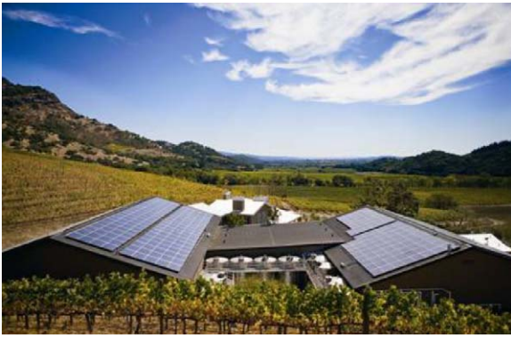
Fig. 11. Photovoltaic system at the Shafer vineyard winery (reproduced by kind permission from Shafer Vineyards).