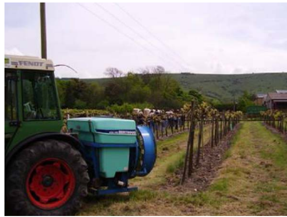
Fig. 4. Spray application of herbicides in a vineyard in Southern England.

established soon after planting to provide the necessary continued support.