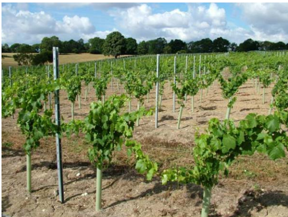
Fig. 2. Tubex growtubes used in Ridgeview vineyard, Australia.

Once a suitable layout has been determined the vines should be planted in a north/south row alignment, unless there are other contributing factors. Again the solar input is important as the north/south row alignment ensures an even solar distribution across the vine canopy in later years. Ground coverage in the form of polymer mulch mats, laid before planting to make the laying process easier, can have a significant effect on the soil and will immediately effect solar collection in the vineyard.