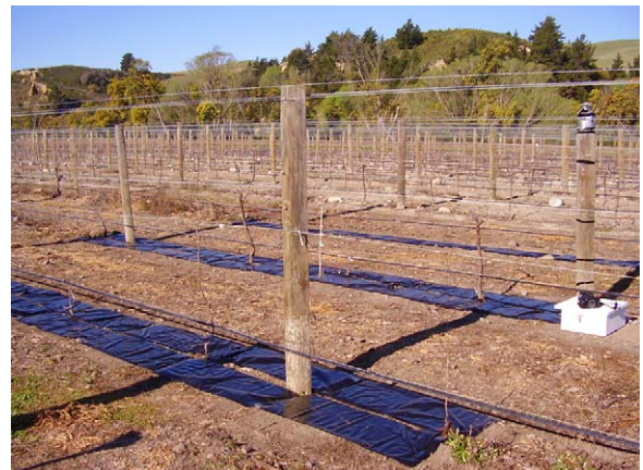
Fig. 7. The solar water heating quilt in field trials [6].