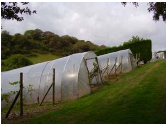
Fig. 3. Polytunnels used in a vineyard in Southern England.

The training of young vines in the first 2 years is critical to the future performance of the vineyard. Vines that do not establish well due to poor cultural management are usually set back several years. One goal is to establish a large healthy root system by promoting maximum amounts of healthy, well-exposed foliage. To accomplish this goal during the first 2 years, care must be taken to train vines properly and ensure a healthy growing environment. Grow tubes can provide this environment and promote rapid shoot growth early in the season, resulting in a single dominant shoot that has long internodes and is very straight. A trellis should be