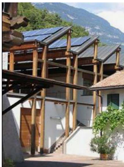
Fig. 9. Solar installation at Alois Lageder.

The Alois Lageder vineyard/winery in Bolzano, Italy promotes the use of solar thermal and PVs, including good passive design features in its winery. The winery has 24 m 2 of solar collectors with storage and has been reported to supply the winery with all the hot water it needs. In addition, 160 PV modules (136 m 2 ) are mounted