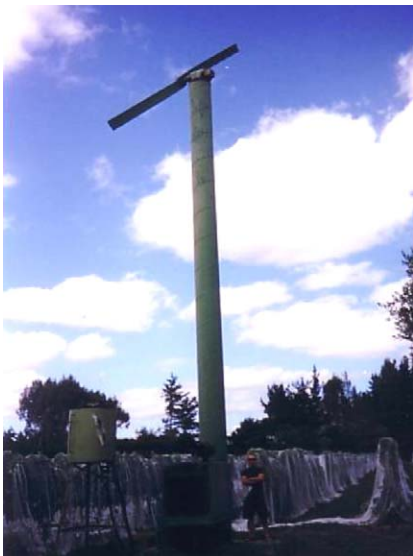
Fig. 6. Diesel powered wind mill for frost protection at the Gladstone vineyard, Martinborough, New Zealand.

Vineyard fertilization practices aim to improve the supply of available soil nutrients to the levels required for optimum grapevine growth and yield. Most soils will contain the adequate amount of essential nutrients, but is normal to introduce a