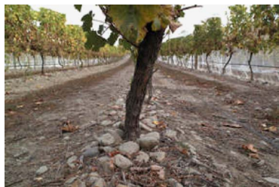
Fig. 1. Enhanced solar collection and storage using a stony site at the Waipara Valley Vineyard, Pegasus Bay, New Zealand.

The process of site preparation and planting is mechanically intensive and requires significant energy input. In the year prior to planting, the ground may be sub-soiled, followed by ploughing and harrowing. There may also be a drainage requirement and fertility adjustments to the soil. These activities require input from large agricultural vehicles and mechanical equipment. Electrically powered farm utility vehicles are becoming very popular. In the vineyard the potential application of such vehicles is significant. They are quiet, nimble and have increased responsiveness and produce no localised pollution. Add to this the potential for photovoltaic charging, they could offset a significant portion of carbon emissions in the vineyard. Properly charged and maintained electric vehicles should be able to run for a full day carrying out a range of functions. However, the vehicles and mechanical equipment used in site preparation require significant horsepower and thus are wholly dependent upon fossil fuels. It is unlikely that solar energy in the form of photovoltaic powered vehicles could be of benefit in this application.