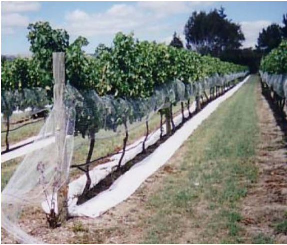
Fig. 8. Reflective white mulching mat used at the Gladstone vineyard, Martinborough, New Zealand.

management program to complement the soil's ability to provide the nutrients needed to sustain adequate vigour and produce the desired quantity and quality of crop. There are a wide variety of means in applying fertilisers, composts and manures, all which requires mechanisation. As in pest and disease control methods, PV electric powered vehicles may be an ideal substitute to conventionally fuelled vehicles in carrying out these processes.