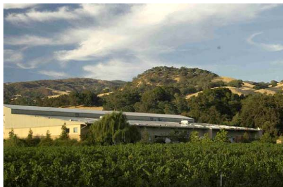
Fig. 10. Photovoltaic system at Fetzer's administrative building (reproduced by kind permission from Brown-Forman Corporation).

on the winery roof at 30° facing south-southeast at 17.7 kWp (Fig. 9).